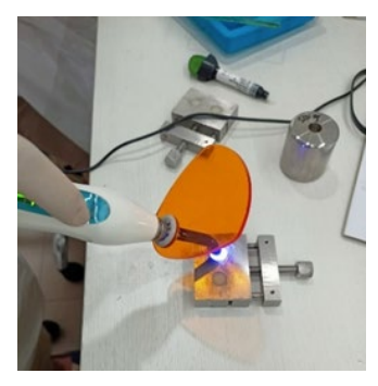
Figure 2. Nanohybrid composite resin sample under light cure

a gauge range of 400 \mu m. Each sample was first immersed in ice tray container with 10 mL distilled water for 24 hours.