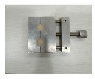
Figure 1. Sample on the stainless-steel mold