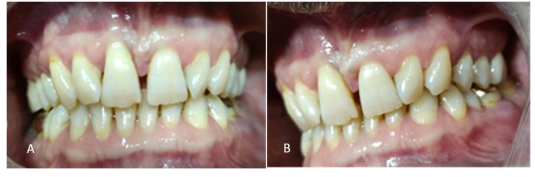
Figure 1. (A) Front view of clinical conditions and (B) Left side view of clinical conditions

The treatment plan for this case was comprehensive, starting with removing the etiology of plaque and calculus by scaling and root planing (Figure 3(A)). Then adjuvant local antibiotic therapy