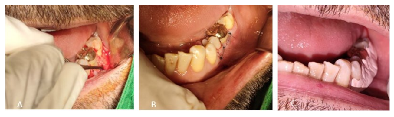
Figure 6. (A) Periodontal membrane in areas 37, 36, 35. (B) Suturing the periodontal membrane with absorbable suture, suturing regions 37, 36, 35 with interrupted technique with nylon thread. (C) Installation of periodontal dressing