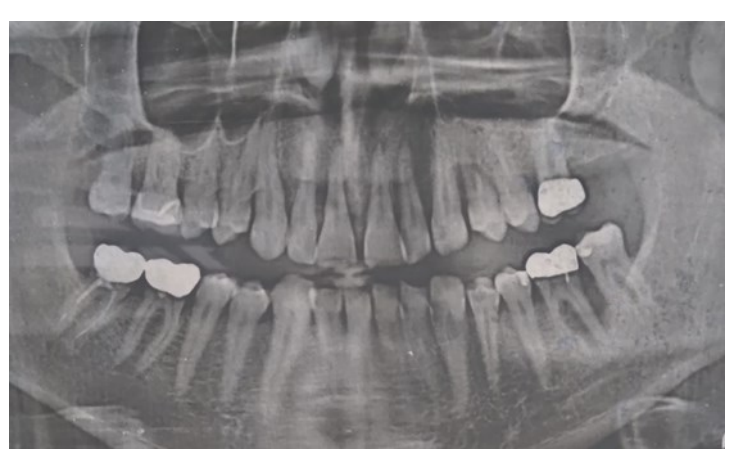
Figure 2. Panoramic radiographic image of tooth 36 shows a radiolucent image along the root, illdefined border, periodontal ligament space and lamina dura disappear, vertical alveolar bone resorption. radiodiagnosis revealed a periodontal abscess on tooth 36