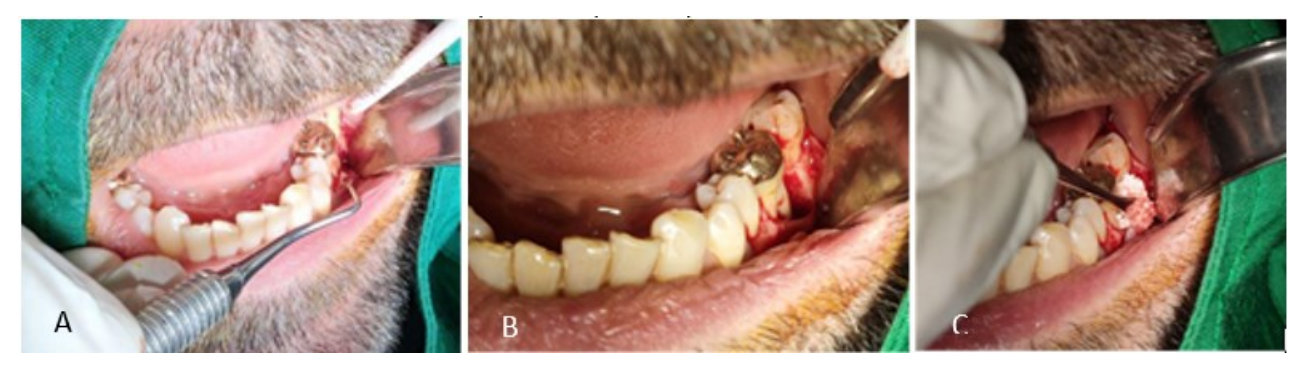
Figure 5. (A) Cleaning of granulation tissue with a surgical excavator and gracey curette accompanied by root planing on teeth 37, 36, 35. (B) Cleaning and smoothing of bone defects from granulation tissue in the periosteum with a file. (C) Bone graft application with Ossteon II Collagen brand