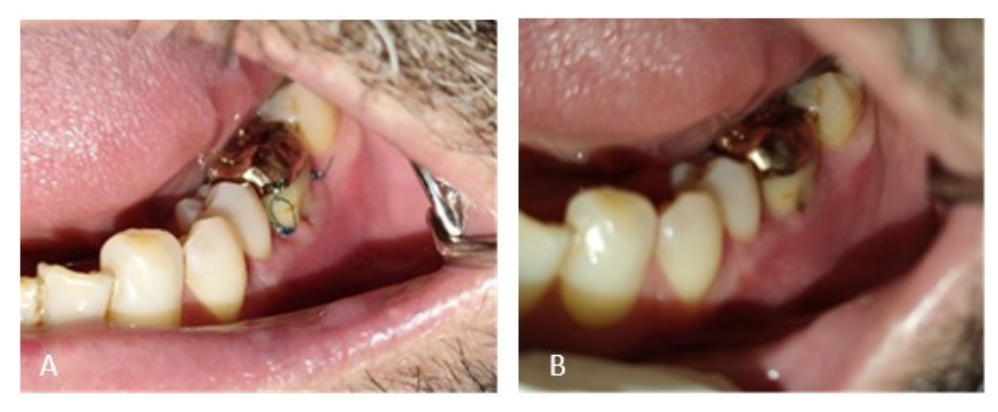
Figure 8. (A) Control at 3 weeks; (B) After suture removal with 0.9% NaCl irrigation and oral hygiene instruction