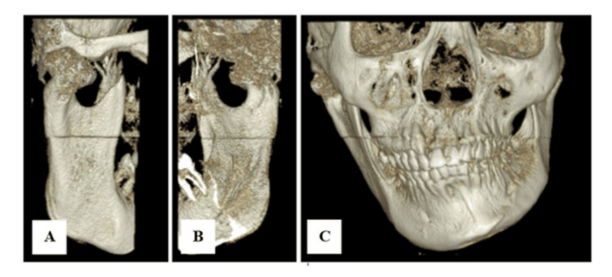
Figure 5. 3D view of CBCT examination; A. Lateral view, B. Medial view, C. Frontal view