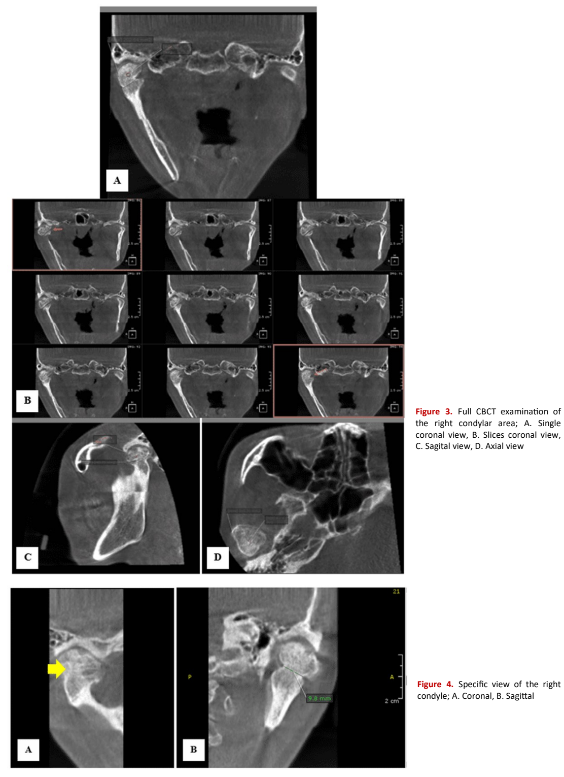
Figure 3. Full CBCT examination of the right condylar area; A. Single coronal view, B. Slices coronal view, C. Sagital view, D. Axial view