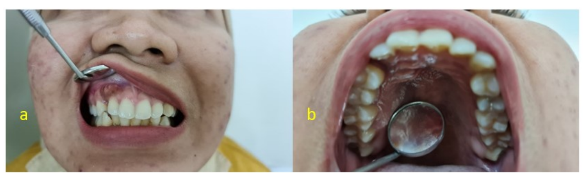
Figure 1. a. Changes on color and consistency of gingiva in related to missing 13 and b. Palatal bulge in right slightly pronounced compared to the left region

Although in some experimental studies, these prediction models using panoramic provides quiet satisfactory two-dimensional view of the impacted teeth, but in a recent publications these method reported still inadequate to sketch a clinically