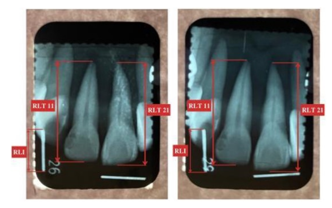
Figure 2. Measuring the vertical dimension of a tooth on a periapical radiograph