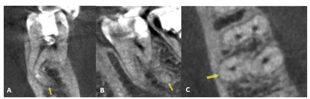
Figure 1. The CBCT of left mandibular first molar in (A) Reformatted coronal plane; (B) Sagital plane; (C) Axial plane. The yellow arrow showed the dilacerated distobuccal root.

Diagnosing a dilaceration was critical for root canal therapy, extractions, and orthodontic movement, so investigating dilacerations had evident benefits for patient care. 1,5 Two hypotheses have been suggested to explain the origins of dilaceration: the first was initial tooth trauma that induces tooth germ displacement, causing the permanent tooth root to form an angle. A second theory deals with a developmental disorder of uncertain origin when a traumatic factor wass unknown.^{1,3,6} \ \ {}^{\bar{}} Careful \ radiography \ interpretation could detect changes in the normal structure of roots in the mandibular molar. To avoid difficulties or canal loss during root canal therapy, an accurate identification of the third root was required. Specific characteristics, such as the lack of a defined outline of the distal or mesial root contour or the root canal, could indicated the presence of a third root.11