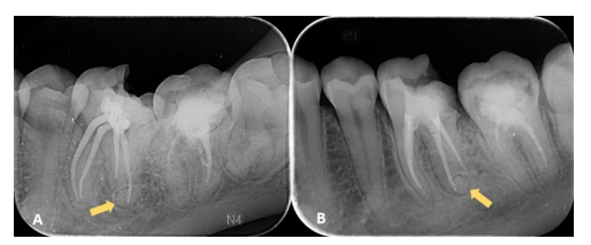
Figure 2. (A) The periapical of obturation trial and (B) evaluation of obturation. The yellow arrow showed a corticated round radiopaque area surrounded by radiolucent band.